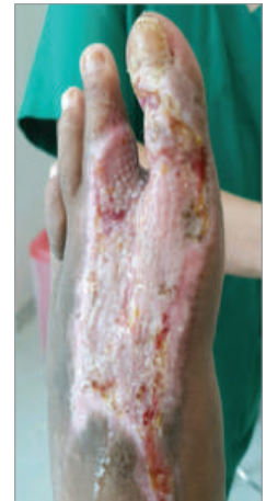
Figure 7. Month 3 of treatment (August 2018)

decreased in size and the patient was able to undergo a skin graft and progress to healing within 9 weeks of treatment [Figure 7].