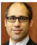
Authors: Tang Tjun Yip, Borripatara Wongprachum, Ibbi Younis

This article is based on a symposium entitled ‘NATROX Oxygen Wound Therapy – A Vital Element in Wound Healing’, which was hosted by Inotec AMD at the Malaysian Society of Wound Care Professionals conference in Kuala Lumpur on 22nd September 2018. The symposium highlighted the role of oxygen in wound healing and how, through an improved method of delivery (NATROX, Inotec AMD), topical oxygen can be a viable and practical treatment for non-healing wounds. Three clinical experts from around the world explored their use of NATROX in a variety of wound types and shared case studies and real-world knowledge in practice.