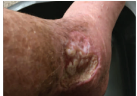
Figure 10. Continued non-healing upon commencing treatment with NATROX (August 2018)

Following 21 days of treatment with NATROX, significant improvement was seen, with the wound finally progressing towards healing [Figure 11]. This resulted in huge benefits to the patient’s quality of life, meaning that she could resume everyday activities and go on holiday, and she was extremely pleased with the results.