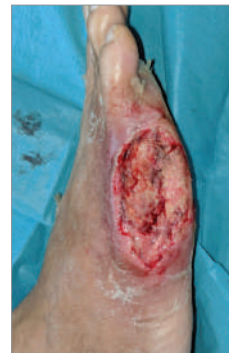
Figure 3. Month 1 of treatment (February 2018)

Due to the complex and non-healing nature of the wound, along with the associated comorbidities, NATROX was selected in order to increase oxygenation and thus stimulate healing. The goal of therapy was to reduce the wound size and improve the condition of the wound bed to facilitate a skin graft. Within 1 month of NATROX treatment there was an increase in granulation tissue and some decrease in wound size [Figure 3].