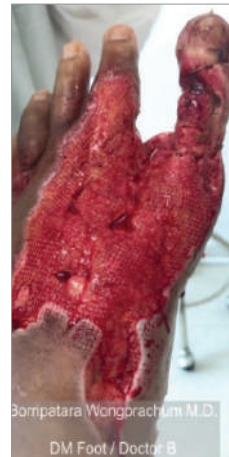
Figure 6. Month 1 of treatment (June 2018)

The patient responded very well to the treatment, which quickly resulted in increased granulation, with granulation tissue covering previously exposed bone [Figure 6]. The wound