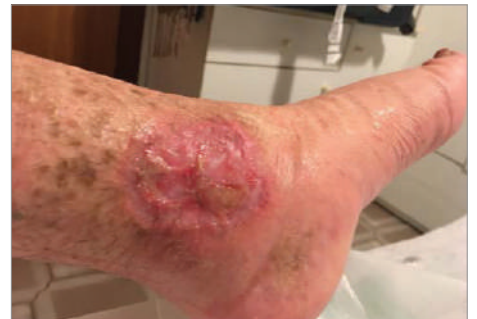
Figure 11. The wound following 21 days of treatment with NATROX (September 2018)