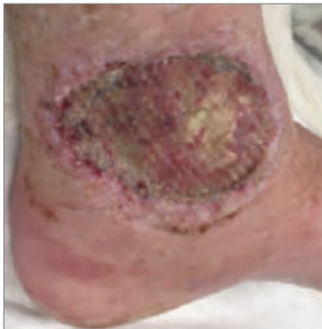
Figure 8. The wound following failed skin graft (January 2018)