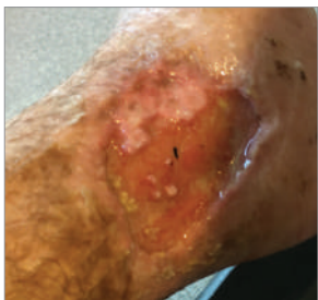
Figure 9. Some improvement when compression therapy commenced although once initial improvement remains static (June 2018)