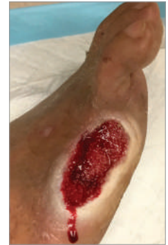
Figure 4. Month 3 of treatment (April 2018)

While the benefits were apparent, due to the complexity of the case, longer-term treatment with NATROX was required and resulted in significant improvements as treatment continued [Figure 4]. After 3 months of therapy the wound was at a stage where a skin graft was planned.