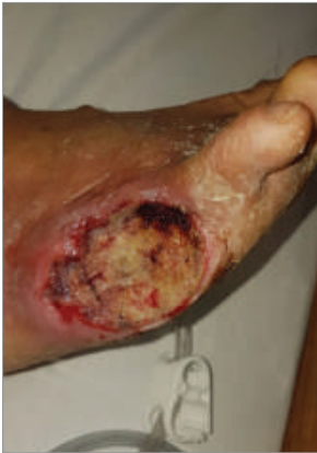
Figure 2. The wound following reperfusion and debridement (January 2018)

of wound aetiologies and clinical scenarios. The cases below were selected as examples to illustrate the breadth of potential uses and in differing goals of therapy.