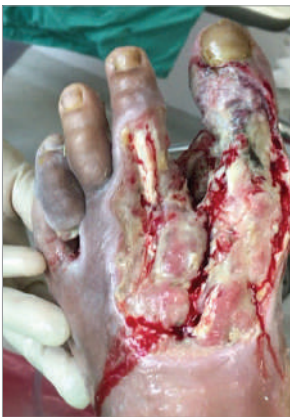
Figure 5. The wound on presentation (May 2018)

While the benefits were apparent, due to the complexity of the case, longer-term treatment with NATROX was required and resulted in significant improvements as treatment continued [Figure 4]. After 3 months of therapy the wound was at a stage where a skin graft was planned.